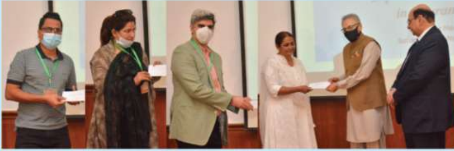
Dr Arif Alvi Honorable President of Pakistan distributed the Cheques to the affectee Complainants during the awareness seminar held at Sindh Governor House.